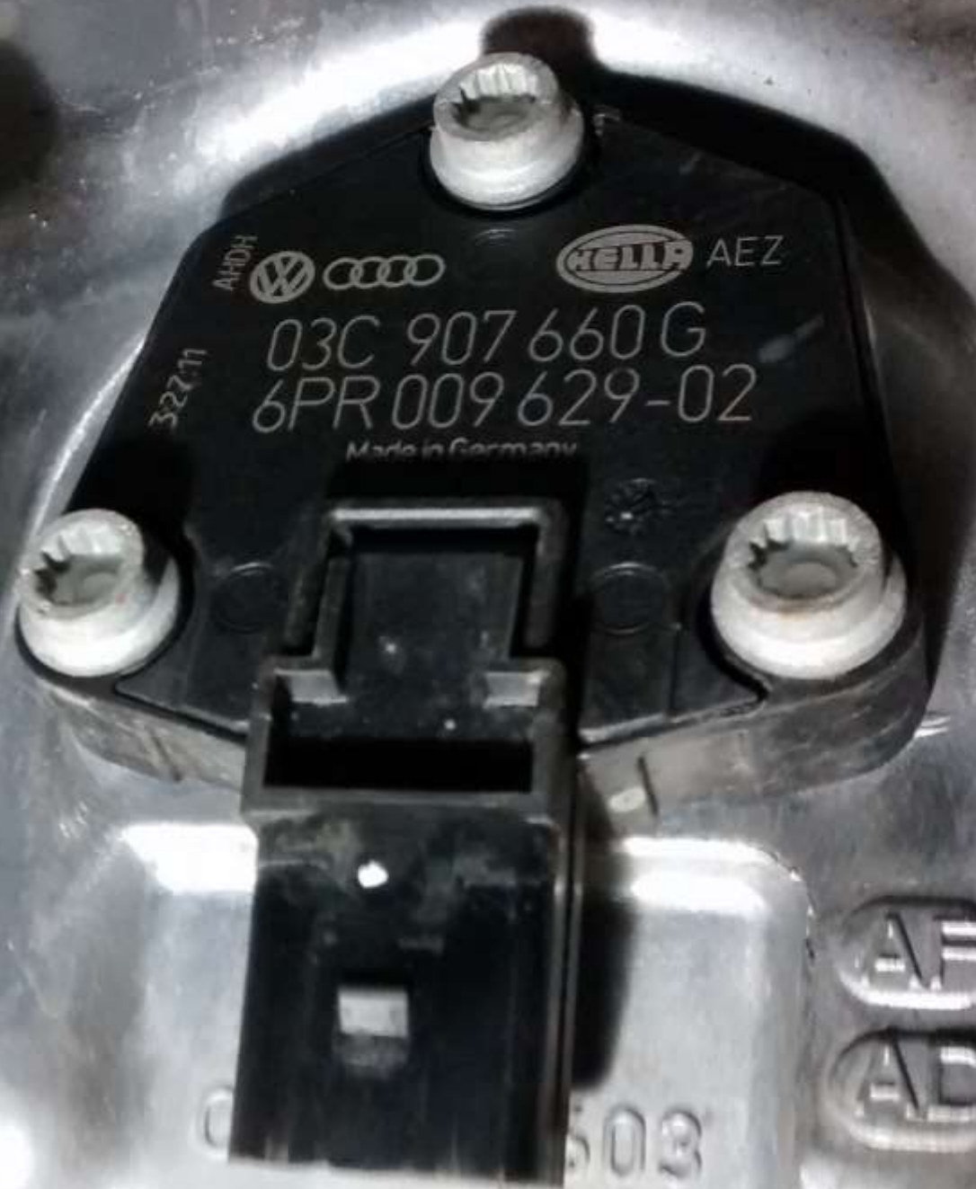
Sump Oil Sensor in-situ picture. Insulation removed